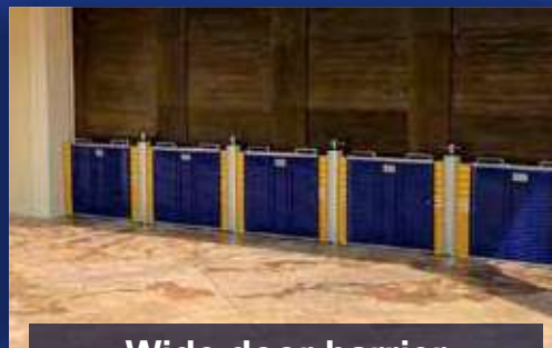
Wide door barrier