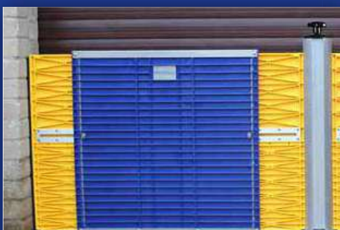
Dam Easy Single door barrier width 780-1,100 mm