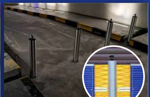
Dam Easy Extension pole