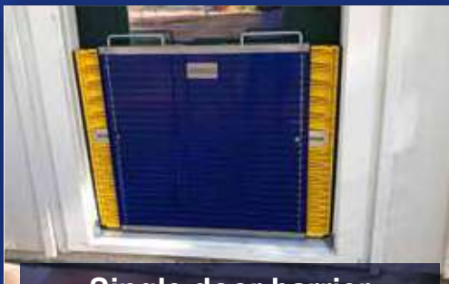
Single door barrier