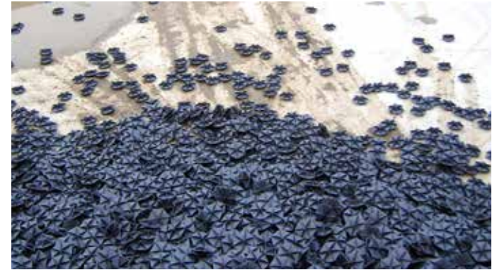
Hexa-Cover® Floating Cover Also installation in empty tank (max 5m drop)