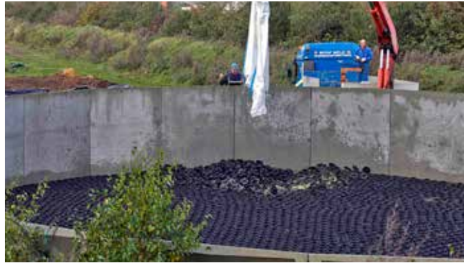
Hexa-Cover® Floating Cover Big Bag delivery and installation: