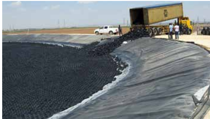
Hexa-Cover® Floating Cover BULK delivery and installation: