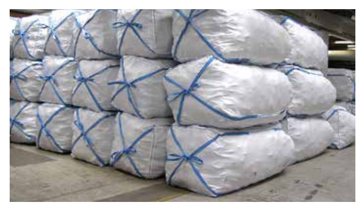
Hexa-Cover<sup>®</sup>Floating Cover BULK delivery and installation:

Hexa-Cover<sup>®</sup> Floating Cover Big Bag delivery and installation: