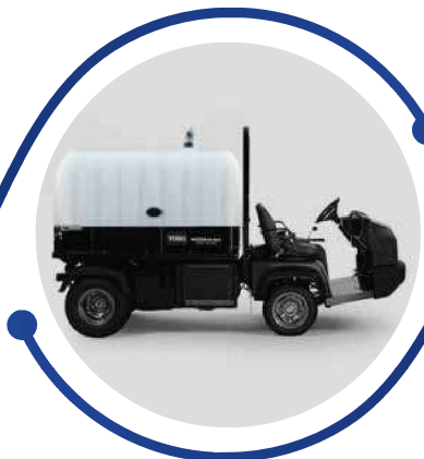
Back up water trucks