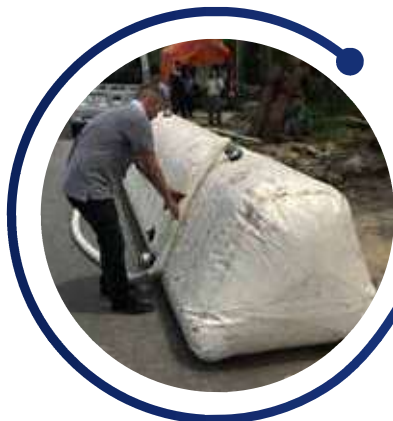
Mobile water tanks

The Tanks cellular construction ensures that it remains stable on any surface irrespective of external conditions making the tank extremely robust and highly effective in to use as temporary or even permanent water storage.